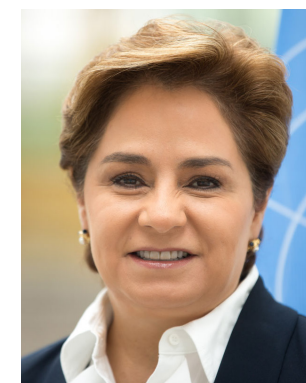
Maroš Šefčovič Vice-President of the European Commission, Co-Chair of the Global Covenant of Mayors for Climate & Energy (GCoM)

Local and regional governments have become a powerful catalyst towards ever higher climate action. Their participation in the Talanoa Dialogue will be a key driver towards the New Urban Agenda and the accelerating global efforts to deliver the Paris Agreement at speed and at scale.